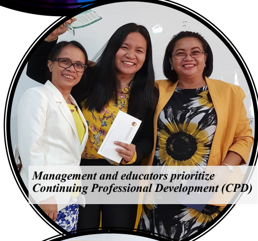
Management and educators prioritize Continuing Professional Development (CPD)