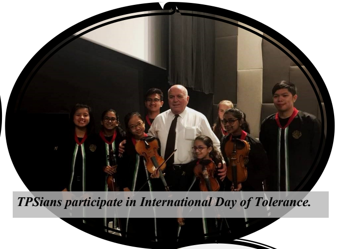
TPSians participate in International Day of Tolerance.