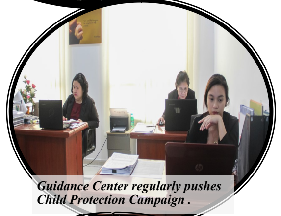
Guidance Center regularly pushes Child Protection Campaign.