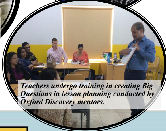
Teachers undergo training in creating Big Questions in lesson planning conducted by Oxford Discovery mentors.