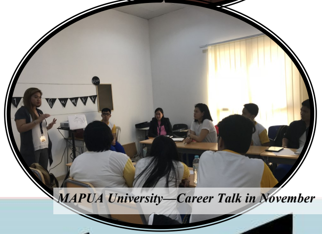
MAPUA University—Career Talk in November

Social responsibility and innovative skills