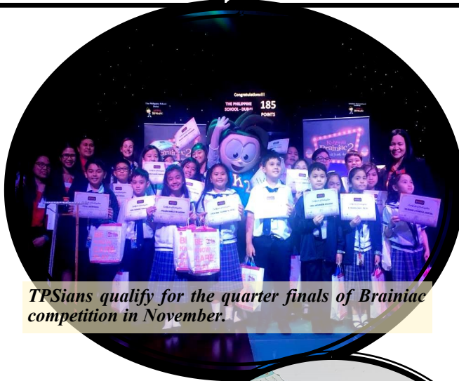
TPSians qualify for the quarter finals of Brainiac competition in November.