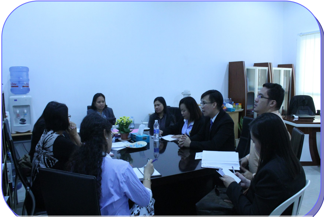
On high level talks! Dep Ed officials and TPS Academic Heads discuss process of inspections.