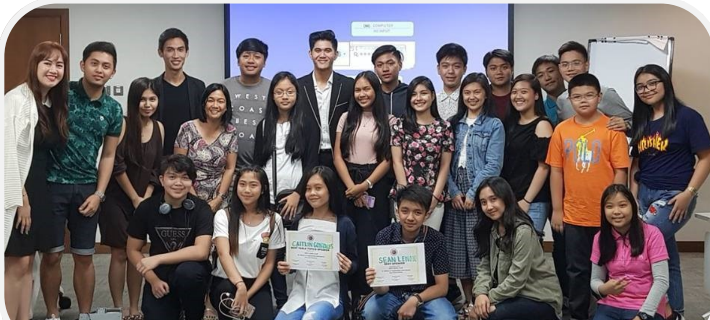
Following similar Toastmasters club meeting protocols, Gavel clubs use club officer titles and education manuals. However, gavel club members are referred to as “gaveliers”. Gavel clubs also provide Toastmasters members and clubs with an excellent opportunity for community service.

Toastmasters International is nonprofit educational organization that operates clubs worldwide for the purpose of helping members improve their communication, public speaking, and leadership skills.