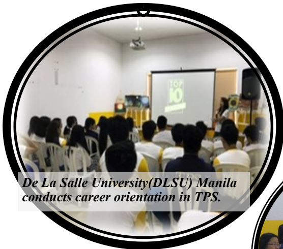
De La Salle University(DLSU) Manila conducts career orientation in TPS.