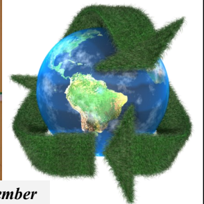
Green House project launched in TPS in November